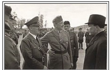
Adolf Hitler, Mannerheim and Ryti in Finland in 1942. Hitler visited on Mannerheim's 75th birthday.

After considerable pressure from the Soviet Union, Ryti was sentenced to 10 years imprisonment, in a trial widely held to be illegitimate and a miscarriage of justice from the Finnish perspective . Along with Ryti, seven other high officials were sentenced to prison, although for shorter terms. The group was convicted using an ex post facto law, which had been instituted for the purpose by the Parliament of Finland . Although the