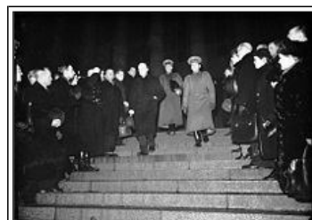
Having given the solemn oath on 19 December 1940, Ryti leaves the parliament alone. His predecessor, Kallio, suffered a heart attack and died the same day.

In August 1940 Ryti also agreed to secret military cooperation with Germany, in order to strengthen Finland's position vis-à-vis the threatening Soviet Union. Over time it became increasingly likely that the peace between the two great totalitarian powers would end, and the experts'