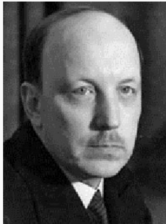
5th President of Finland