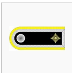
Shoulder strap SS-Oberscharführe (SS-Standartenjunker)