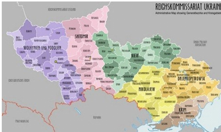
Map of the Reichskommissariat Ukraine

The German occupation of the Soviet Republic of Ukraine, in 1941, created the Reichskommissariat of the Ukraine.