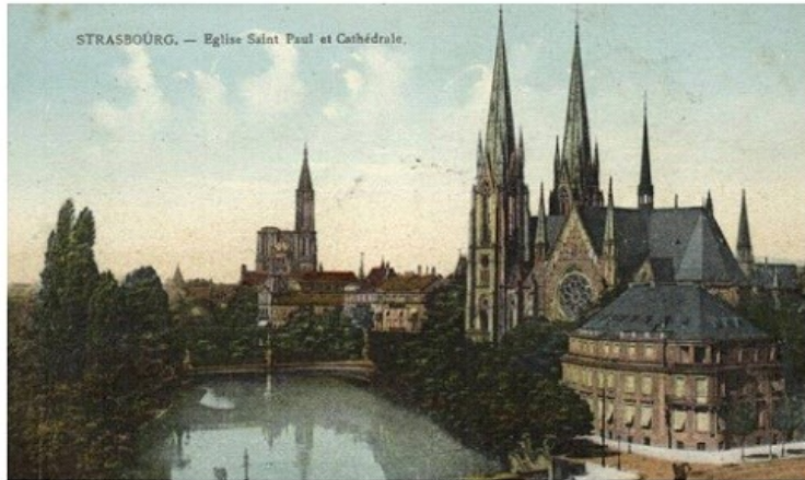
Strasbourg From: An Old Postcard

The alternating German occupation - French occupation of Alsace has been ongoing for centuries now.